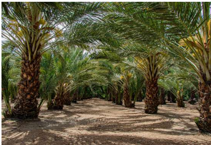
05-Date Palms of Palm Desert Janet Azevedo

COMMENT: Spectacular subject matter, nice composition, color and contrast. Could you have taken a panoramic of the same scene? Might have been even more impressive.