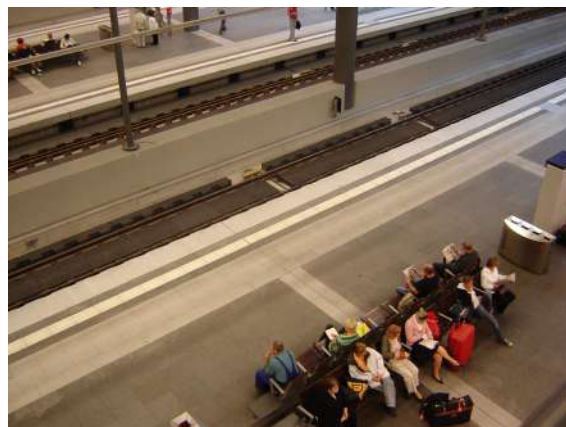
Waiting for the Train Brian Spiegel