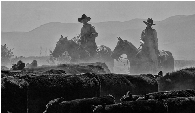
02 - Cattle Drive in Nevada

I would have aimed a bit higher —just a little less grass in the foreground and a little more sky in the background — but otherwise, perfect. Beautiful tonalities, shadow and highlight detail, composition, everything.