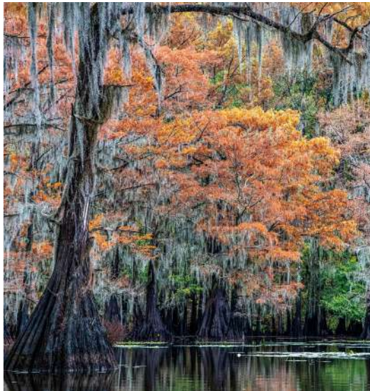
Second Place - Cypress Trees, Caddo Lake, Texas