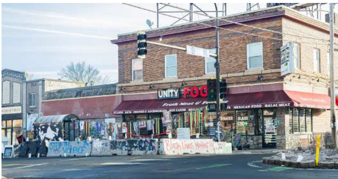
17 - Where it all began, George Floyd Square, Minneapolis, Minnesota

A zillion pictures of the TOPSIDE of the pyramid and nobody ever thinks to shoot the BOTTOMSIDE! The picture itself isn't all that special — why is it B/W??? but you get an A+ for THINKING of shooting it!