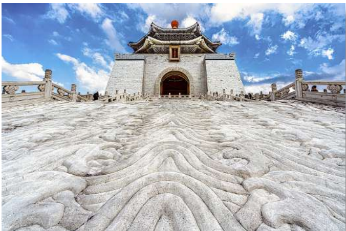
03 - Chaing Kai-shek Memorial