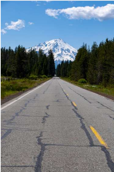
11-Mt Shasta at the End of the Old Road Carol Fuessenich

COMMENT: Another good, matter-of-fact shot. A more special picture might have been a straight-on shot of the side of the building, if there was anywhere you could stand to shoot it straight-on.