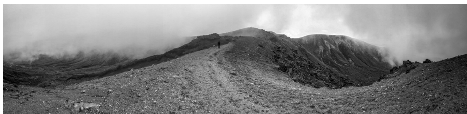
Hiking Into the Storm