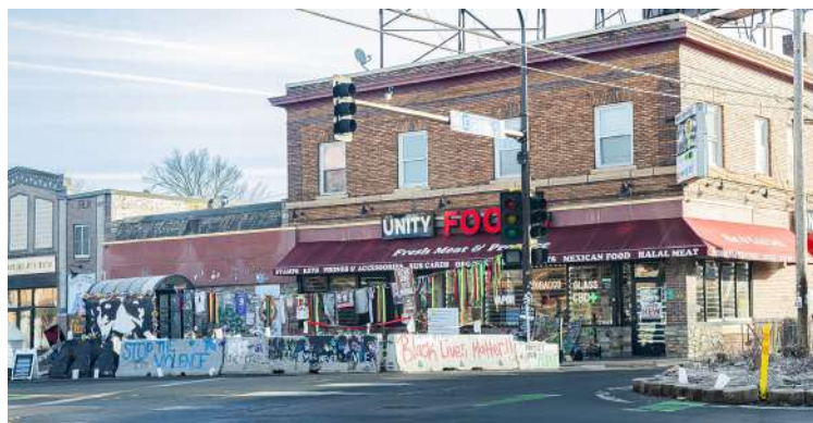
Where it All Began