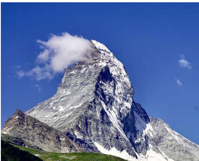
15 - The Matterhorn

Nice, simple, peaceful shot. A slightly lower POV might have made the vehicle stand out more.