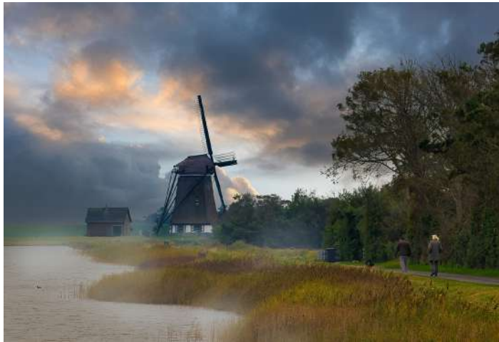
05 - Evening stroll, Netherlands

It's good for what it is, but these days, what with tracking devices that keep the stars sharp over a long exposure, pictures of star trails have become a bit of a "been there, done that..." Whatever is in the foreground (El Capitan?) would have been more impressive in a wider shot. It's an iconic mountain, but that isn't apparent in this shot.