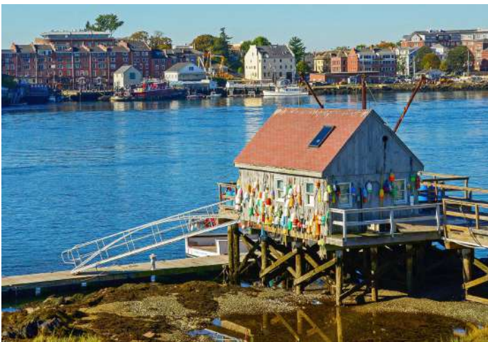
09-Lobster Shack-Badgers Island Ken Jones

COMMENT: Great grab shot. A wider view might have made the Popsicle less noticeable but would have added more context and made for an even more interesting shot. Cobblestone streets are always worth including!