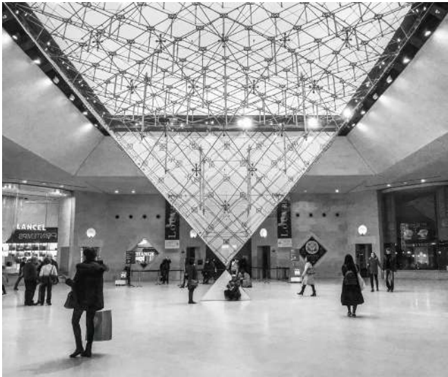
16 - Underside of the Louvre Pyramid, Paris, France