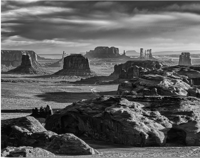
13 - Monument Valley At Sunrise From Hunts Mesa