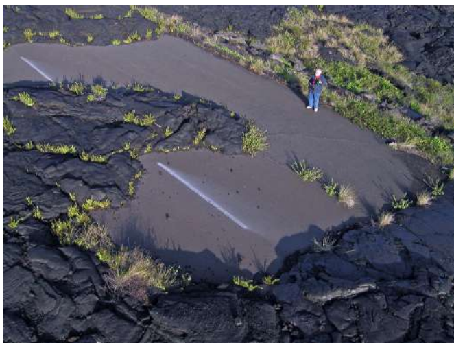
03-Kite View - Lava on the Highway - Big Island HI

COMMENT: Wonderful subject matter but there's too much going on in the picture — the bridge, the town, the hill, the castle, the much lighter and contrasty boats on the left side... Try cropping out just the castle and see how that looks.