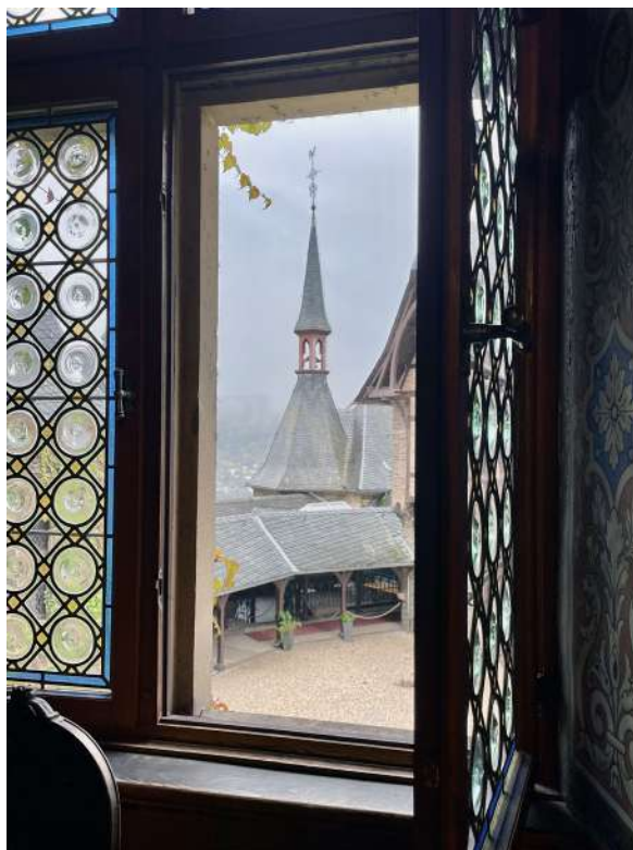
Reichsburg Cochem