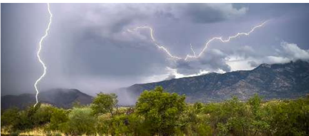
12 - Monsoon Lightening Strike, Catalina Mountains, Az

Thank you for not taking the standard view of Machu Picchu we've all seen a million times (I know; I've been there and I took it!) This view is great except for the boring sky; I'd have shot a wider view if possible, and if darkening the sky wasn't an option, included less of it.