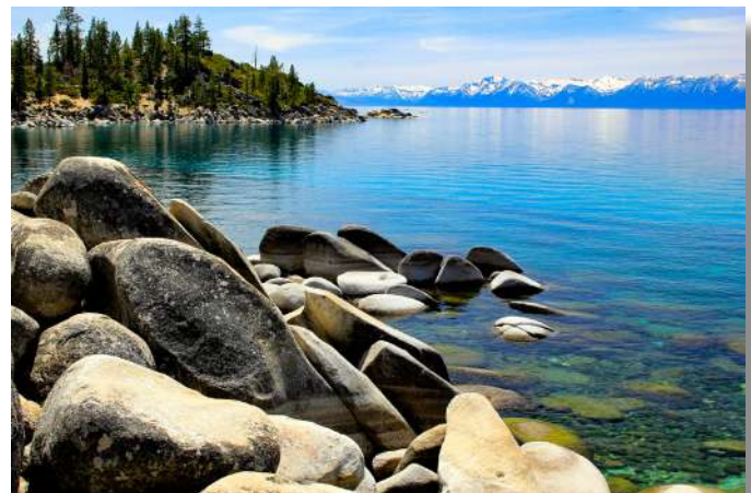
Third Place - Lake Tahoe