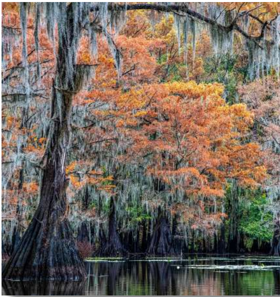
04-Cypress Trees, Caddo Lake, Texas Bill Shewchuk