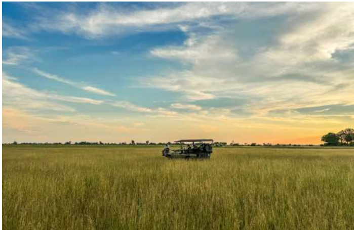
14 - Sunset Safari, Botswana

Gorgeous shot, great composition (except I would have aimed a tiny bit lower to include a bit more foreground). The light is, well, God-like. I only wish you had lugged a 4x5 on a heavy tripod up there and shot it on Tri-X, in which case it would have ranked with some of Ansel Adams' best. As it is, I find the digital compression and possibly in-camera editing somewhat distracting. It looks like it was shot on an old iPhone. Is that your original file or how you processed it?