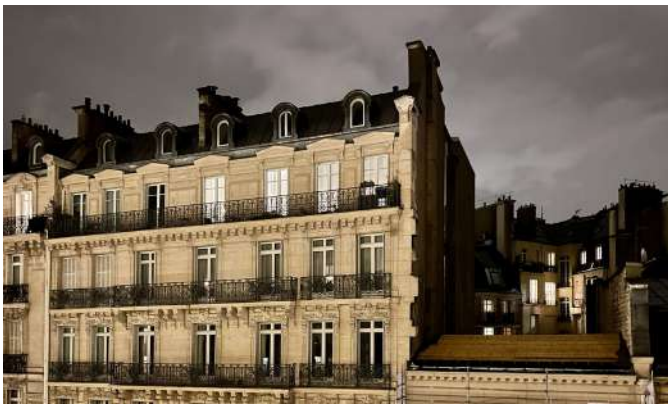
08-Paris Apartments at Night

Wow, talk about being in the right place at the right time! But something bugs me — the thin white line separating the mountains from the background makes it look like the mountains were way over-sharpened, and the transition from sky to mountains on the right looks fishy too. Too heavy a hand with Photoshop?