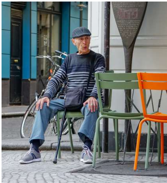
02-Boulevard Joie de Vivre-Paris

COMMENT: Nice shot. I would have aimed the camera a little higher, to take in the tops of the trees. The grass you'd lose in the foreground doesn't contribute much.