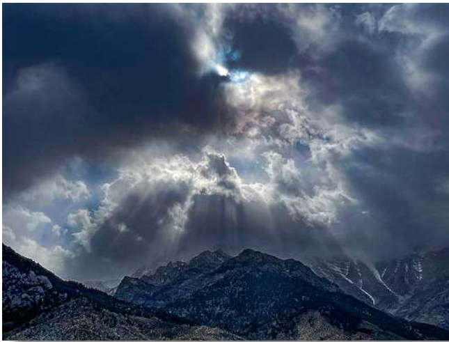
07-Mountain Clouds, Bishop, CA