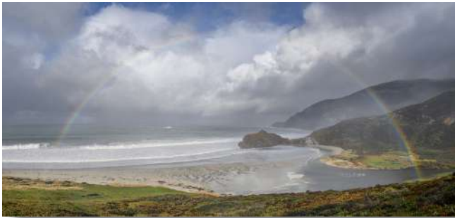
10 - Little Sur River with Rainbow, Big Sur, CA