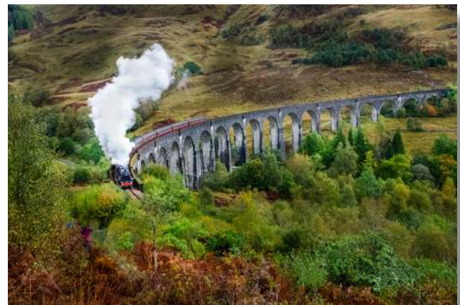
Third Place - Jacobite Train aka Hogwarts Express Jared Ikeda