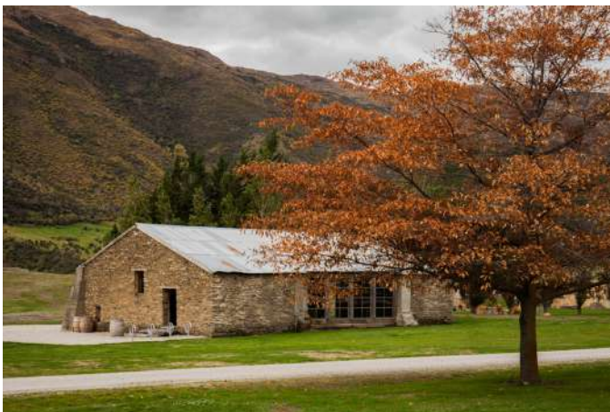
18 - Winery, Central Otago, New Zealand

The kind of picture that makes you want to stop and study all the little details. I spent longer looking at this picture than at any others, thinking about how that fateful day transformed so many lives. As a picture, it's quite matter-of-fact and rather ordinary, but the fact that it's tied to an historical event makes it very special.