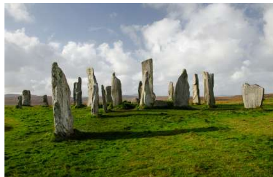
Callanish Stones Scotland