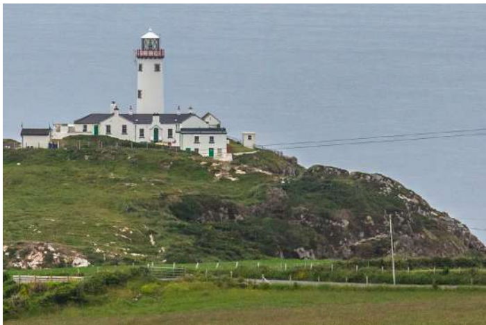
06 - Fanad Head Lighthouse, Donegal, Ireland