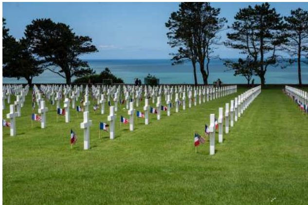
01-American Cemetery Omaha Beach Normandy, France Dick Light