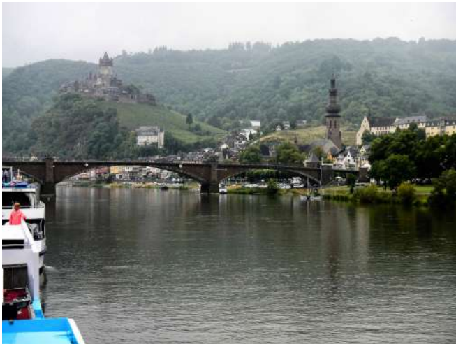
02-Castle on _the Rhine

COMMENT: Nice composition and atmosphere, but too much contrast for my taste, and the color, especially the green in the trees is too saturated. Try reducing both and maybe even the sky will darken a bit, which would help as well.