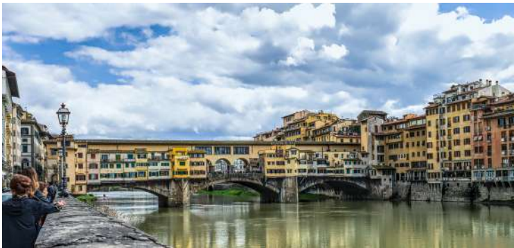
17-The Ponte Vecchio

COMMENT: Great shot except for the color. I don't think it would be stretching the rules to add some blues and cyans in the shadow areas and maybe a touch of red in the highlights — just so the whole picture isn't an unrelenting yellow.