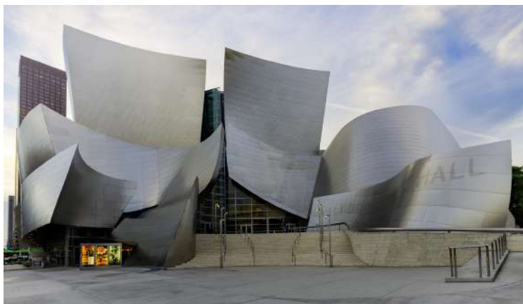
06-Early AM at Disney Hall Lillie Grossman

COMMENT: Hard to resist taking a picture when you're presented with a view like this. Even though the photograph is sort of matter-of-fact, the subject matter is interesting enough to make it worthwhile