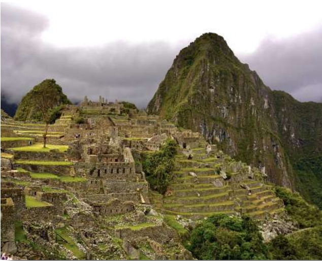
11 - Machu Picchu

Talk about being at the right place at the right time! Beautiful, perfectly composed shot. Try darkening it a little and increasing the contrast just a tiny bit and see if that doesn't improve it — not that it needs much improvement.