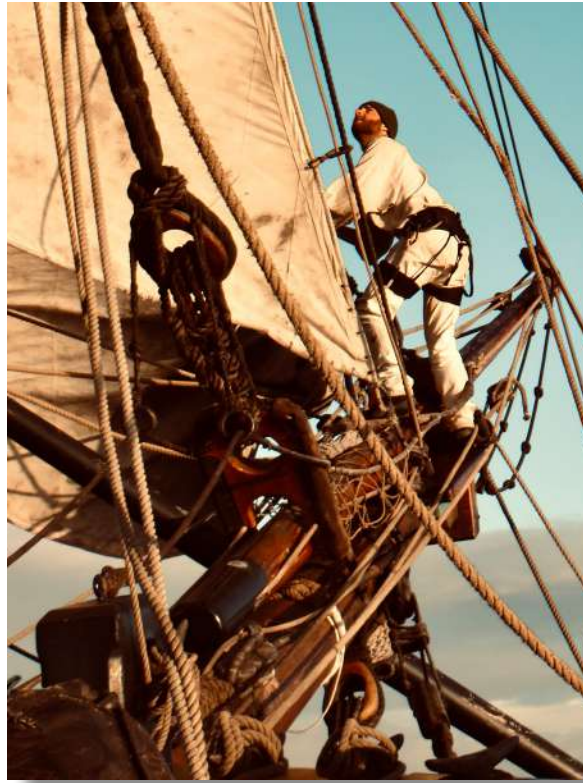
First Place - Sail Ho