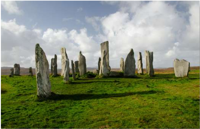
01 - Callanish stones Scotland