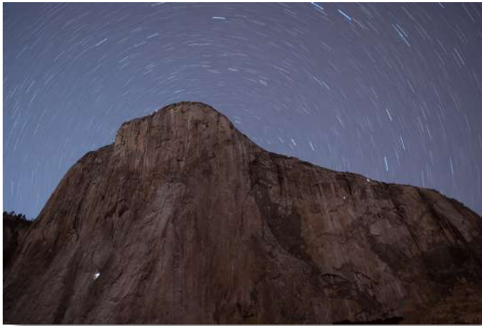
04 - El Capitan, Yosemite, Ca, Star Trails and its Night Climbers