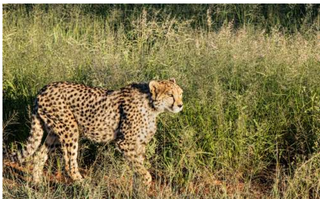
03-Cheetah in the Grasses Janet Azevedo

COMMENT: Great grab shot. A wider view would have included more context, more atmosphere, which would have created a more engaging shot.