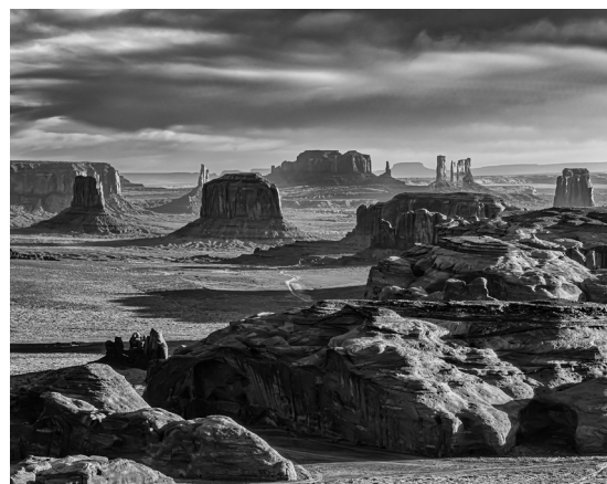
Monument Valley at Sunrise