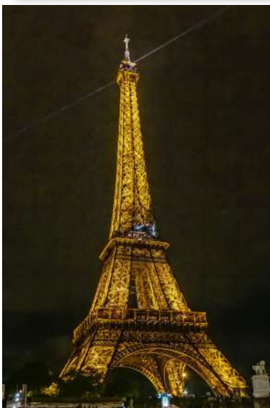
12-Paris Icon Dick Light