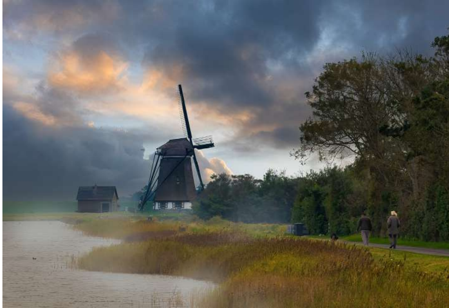
First Place - Evening Stroll, Netherlands Julie Chen